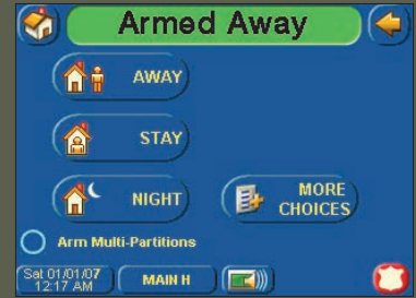
Arm Your System